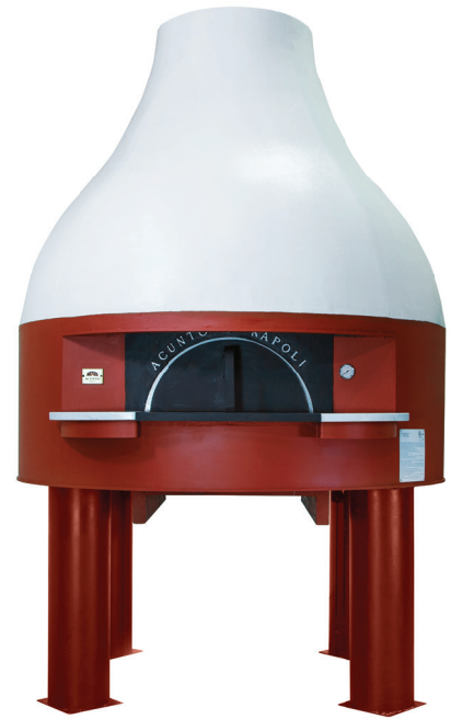
Acunto Vesuvio 130 Model, shipped from Acunto factory

The oven is finished with red and white quartz paint and white Carrara marble countertops - the painted surfaces are prepared for tiling. The oven is provided with removable steel legs to facilitate easier installation. Additionally, the oven may be placed on an existing structure without factory provided legs. Information about the addition of gas burners, custom tiling, or leg options can be found online at www.forzaforni.com .