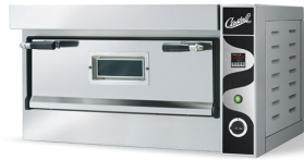
Caldo Single Wide Deck Warming Oven SPB/3