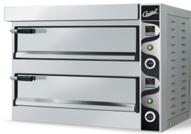
Caldo Double Deck Warming Oven SPB/2C