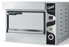
Caldo Single Short Deck Warming Oven SPB/1