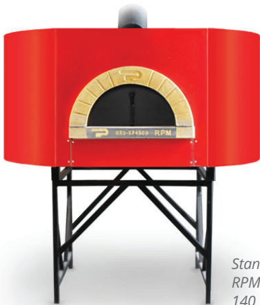
Standard Pavesi RPM Traditional 140 x 180